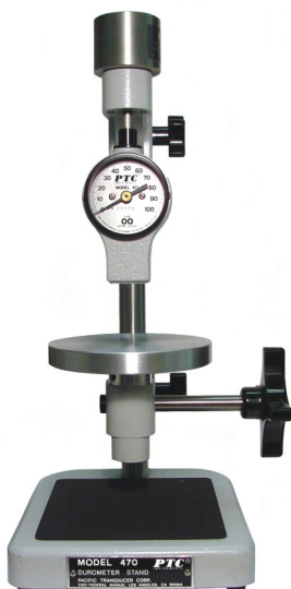
Durometer Stand Model 470

Other durometer types, custom models and durometers from other manufacturers can also be certified by PTC Metrology™.